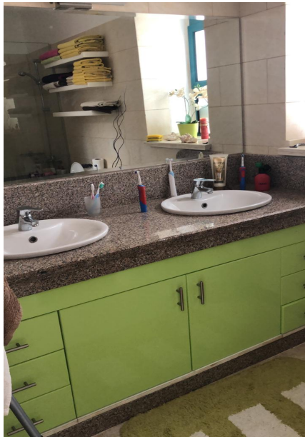
Bathroom with 2 washbasin and bath tub