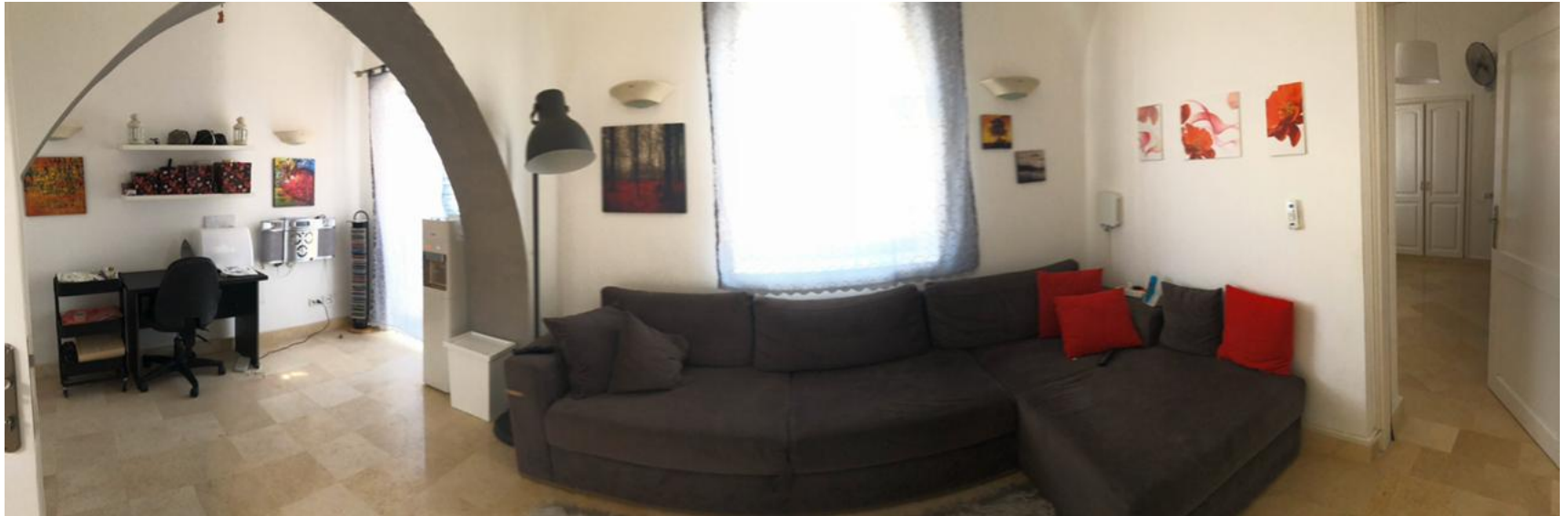
Cosy living room with L-shape sofa and TV (first floor)