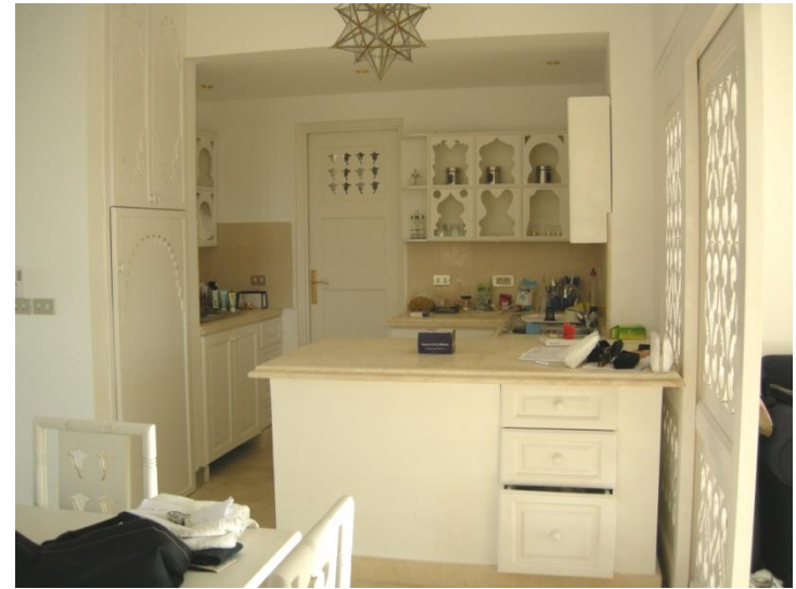
Fully equipped kitchen with hob, mini oven and washing machine