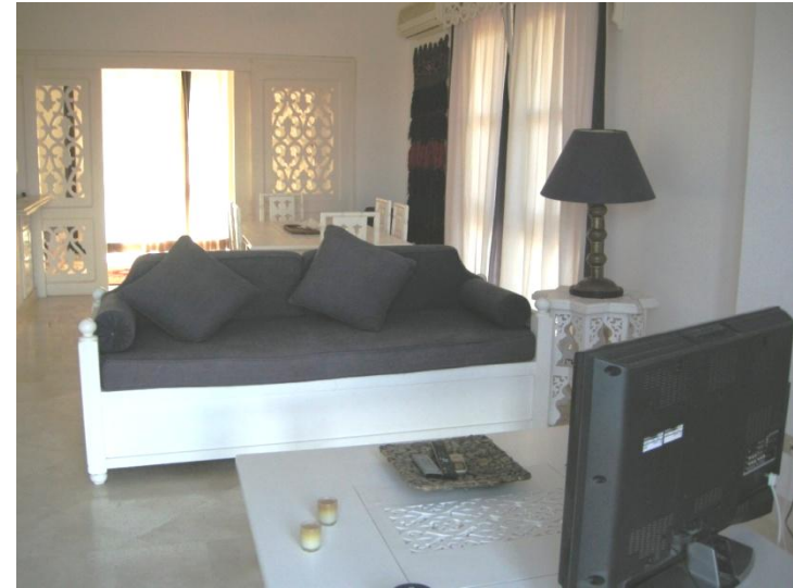
Cozy living room with sofa, flat screen and dining for 6 persons