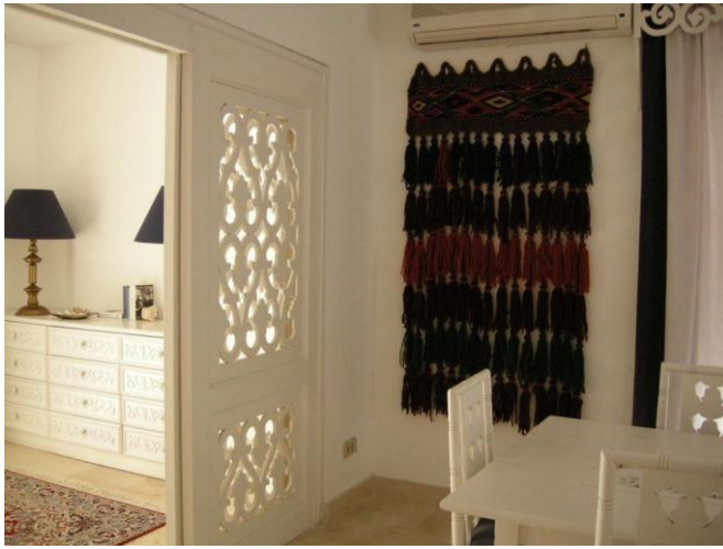
Bedroom with king size bed, commode and small TV