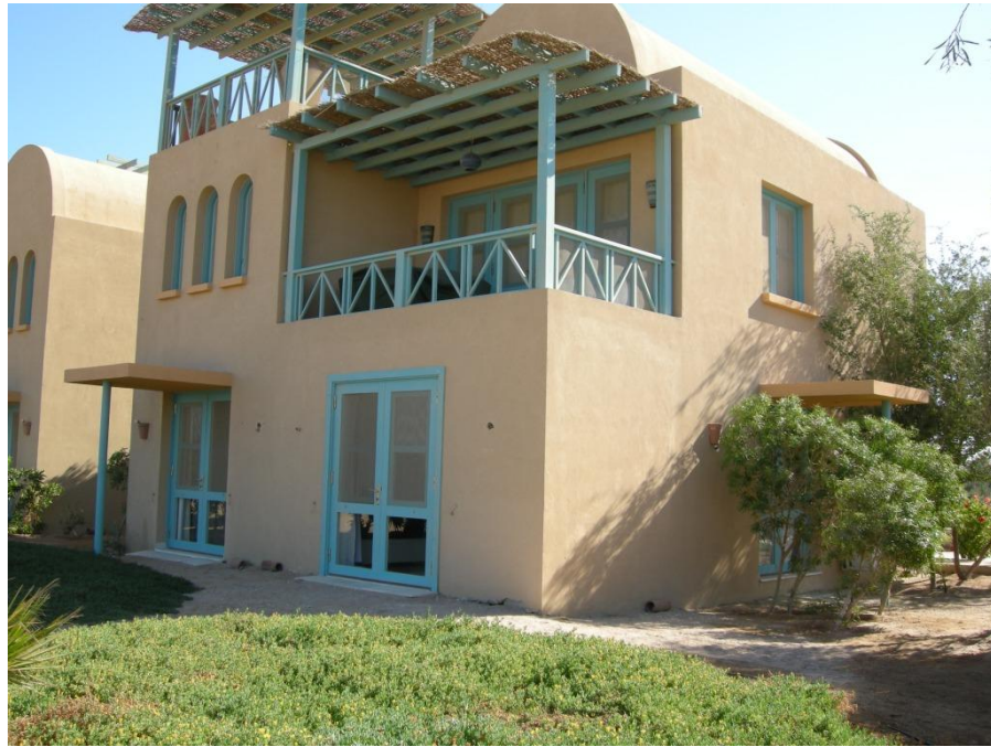
Backside of the building and apartment