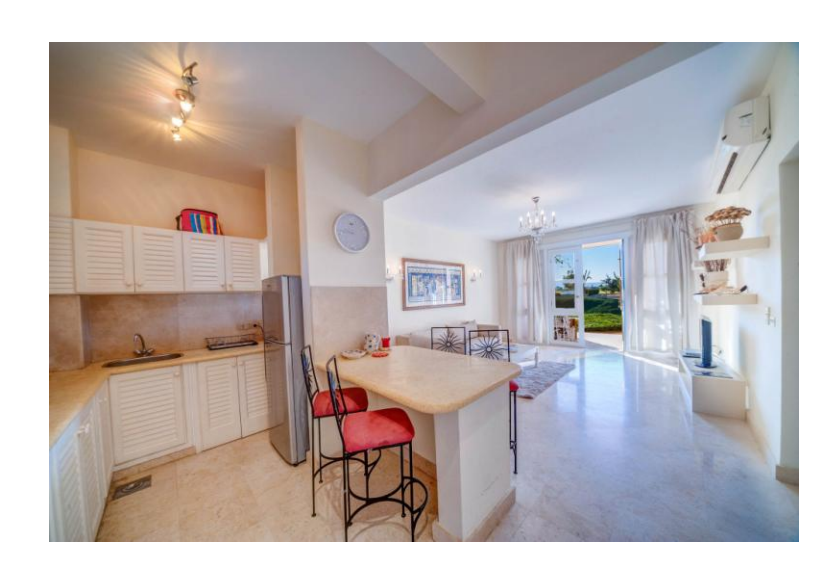
Fully equipped kitchen with fridge, stove and microwave