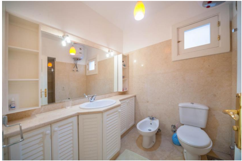
En suite bathroom with shower, toilet and bidet