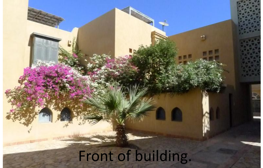
Front of building.