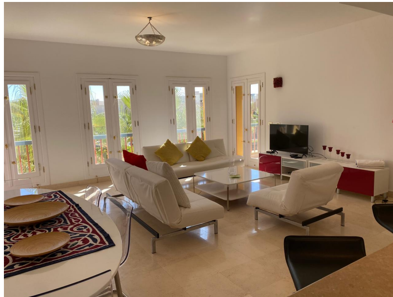
Cosy living room with sofas and TV