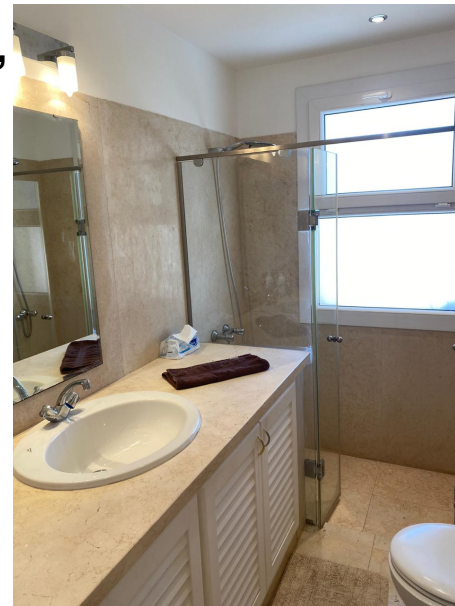
Bathroom with shower and toilet