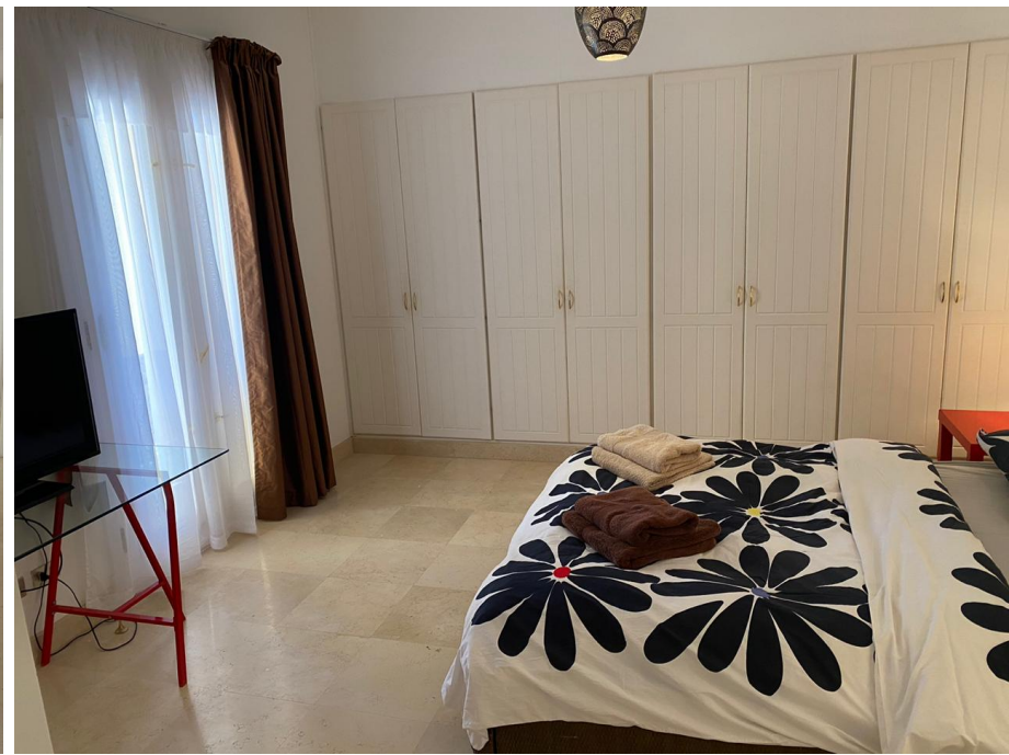
Spacious bedroom with kingsize bed, built in cupboards and TV