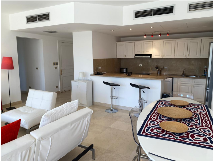
Dining table and chairs