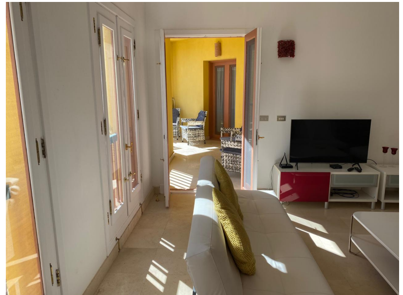
Direct access to the balcony