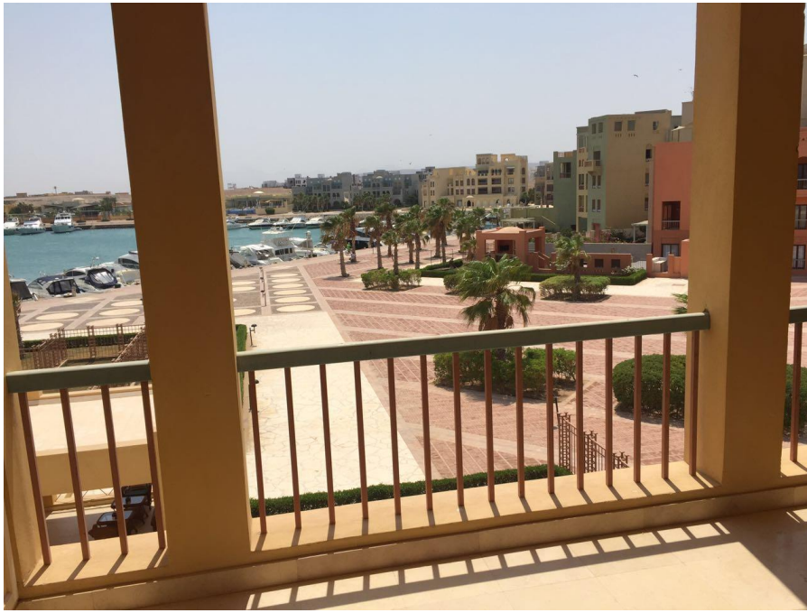
Amazing view to the New Marina from the balcony