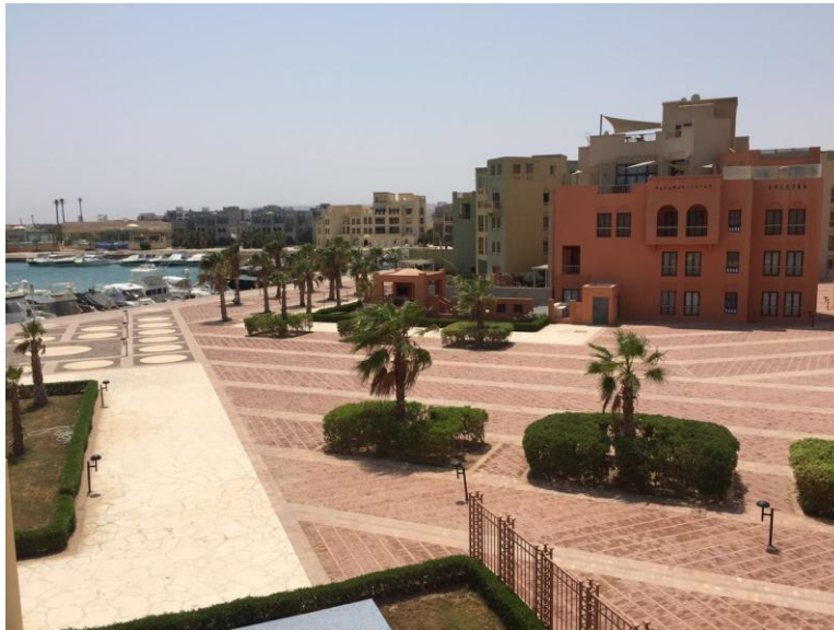
View to the New Marina