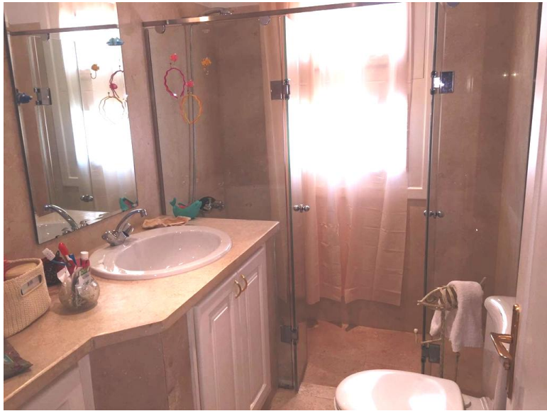
En suite bathroom with shower and toilet