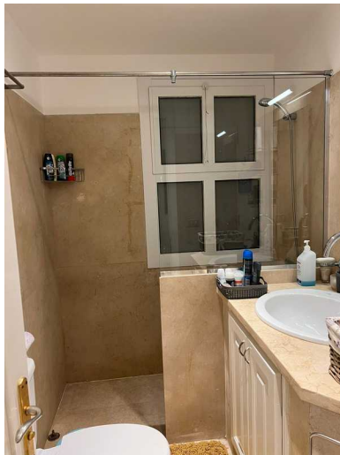
Bathroom with shower and toilet