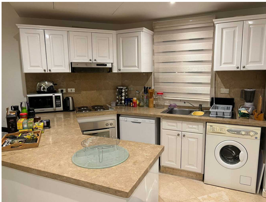
Fully equipped kitchen With stove, oven, fridge and microwave