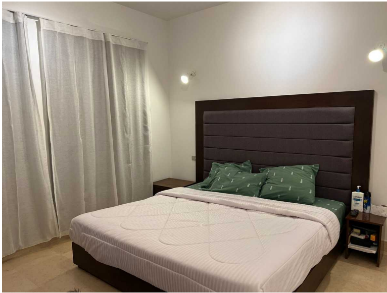
Bedroom with king-size bed and wardrobe