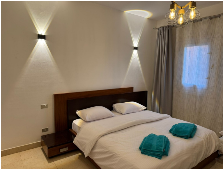
Bedroom with king-size bed and wardrobe