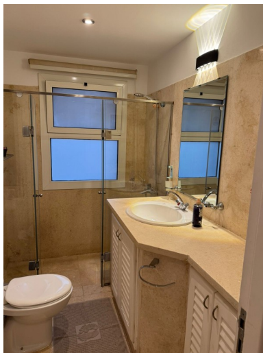
Bathroom with shower and toilet (not ensuite)