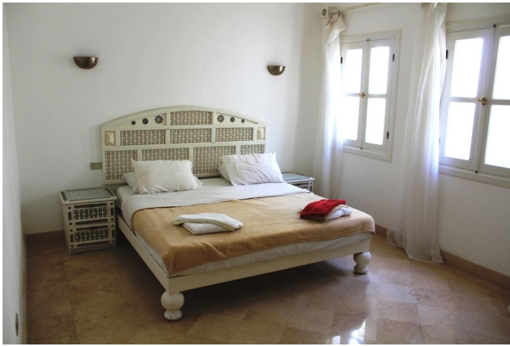
Spacious bed room with double bed, dressing table & mirror and built in wardrobes