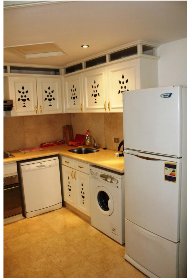
Fully equipped kitchen with fridge, stove, oven, dishwasher and washing machine