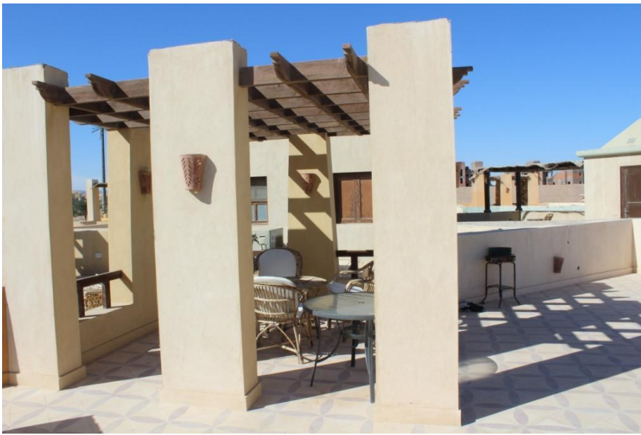
Roof terrace with sitting area, portable BBQ and chaise longs for sun bathing