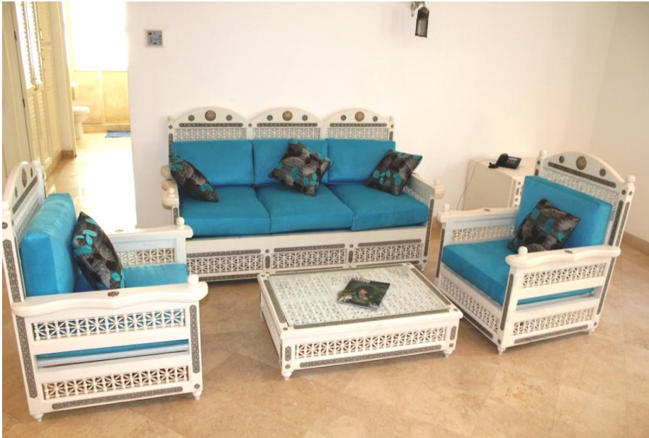
Living room and dining for 4 persons