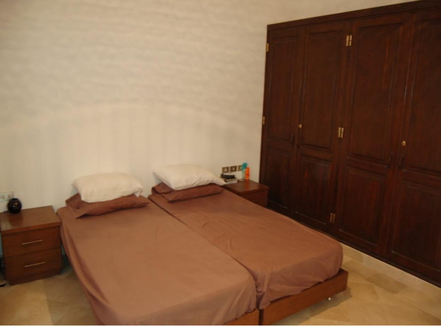
Bedroom with 2 single beds.