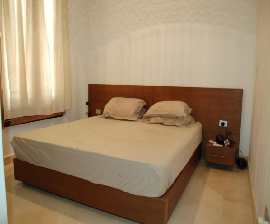
Master bedroom with, king size bed .