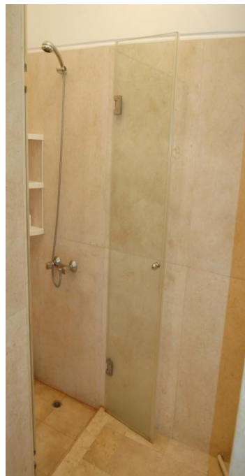
Bathroom with shower and toilet.