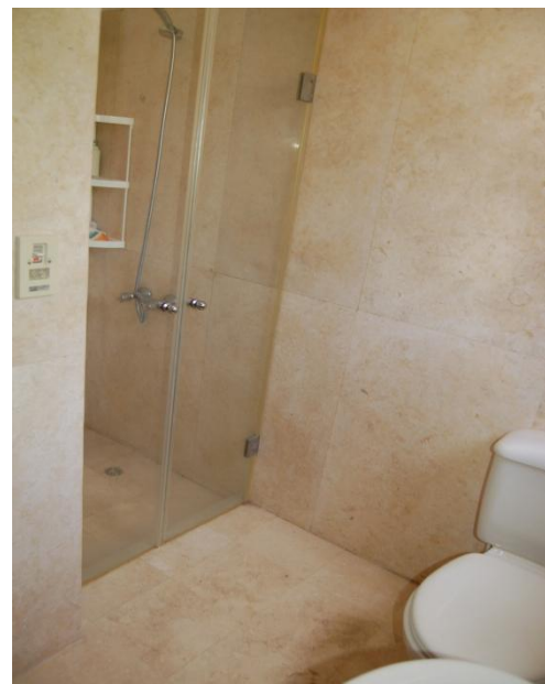
En suite bathroom with shower and toilet.