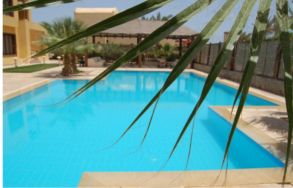
Beautiful green area with the community swimming pool.