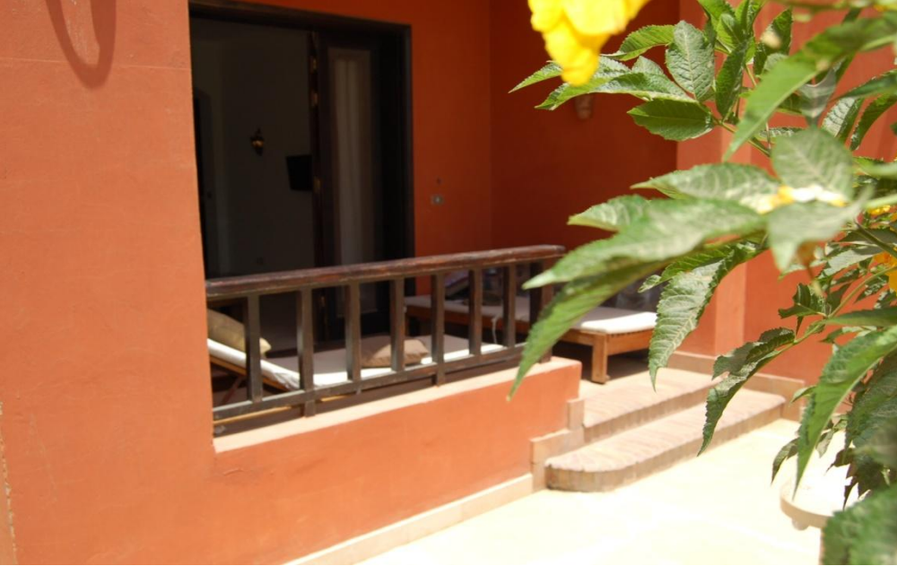
View to the terrace area.