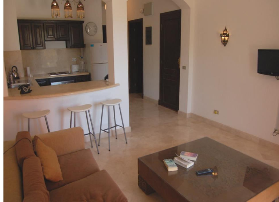
Cozy furnished living room with terrace.