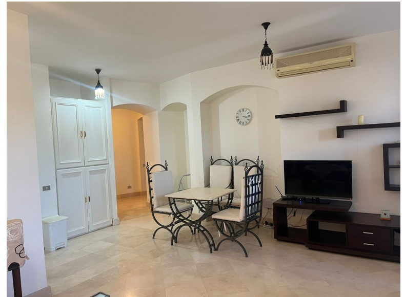
Living room with access to the terrace and lagoon beach