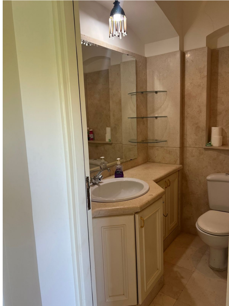
Ensuite bathroom with shower and toilet