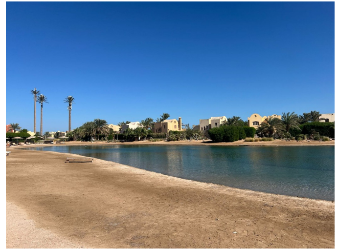
Lagoon beach and artificial lagoon lake in front of the building