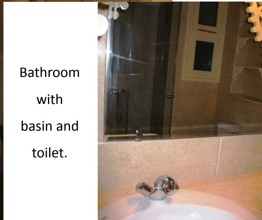
Bathroom with basin and toilet.