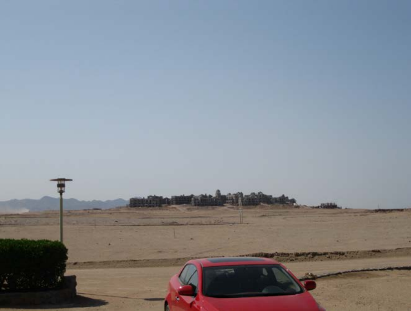
Car park and building entrance.