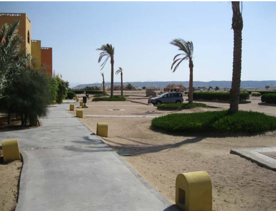
Closely situated to the Abu Tig Marina and Fandir project.