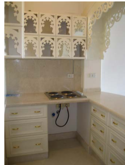
Modern kitchenette with build in fridge, electric stove and lots of storage space.