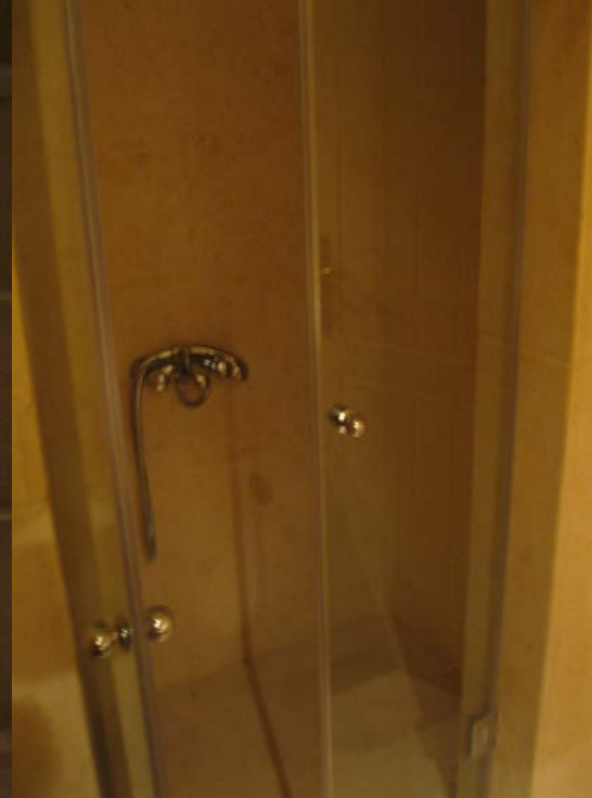
Step in shower with glass doors.