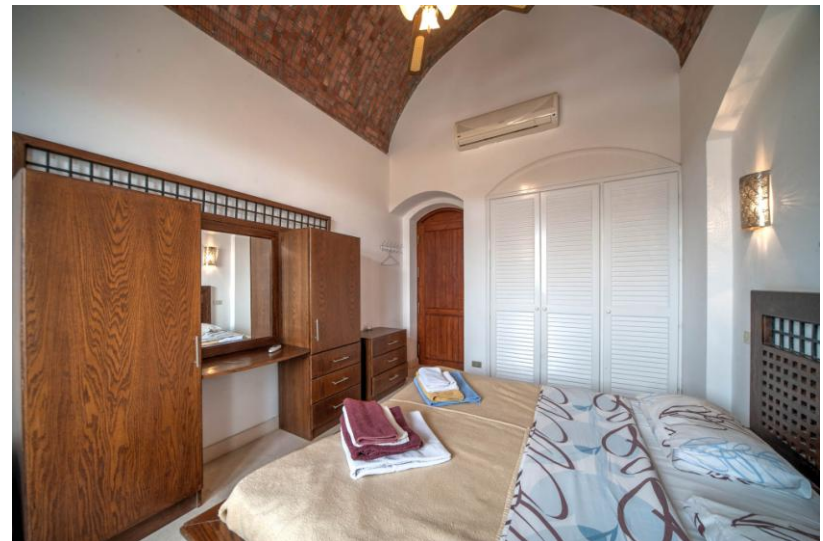
Built-in cupboard and extra wardrobe with dressing table