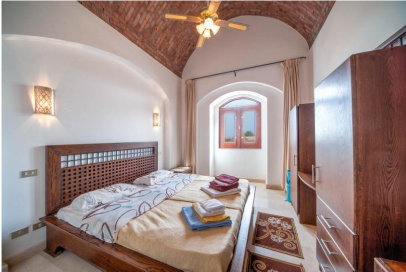
Bedroom with king-size bed