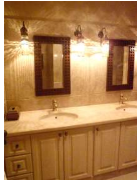
Second bed room and en suite bath room with shower and toilet