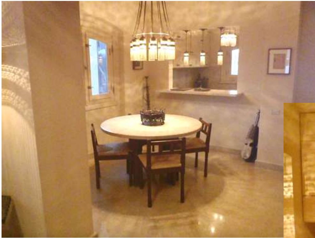
Dining area and fully equipped kitchen