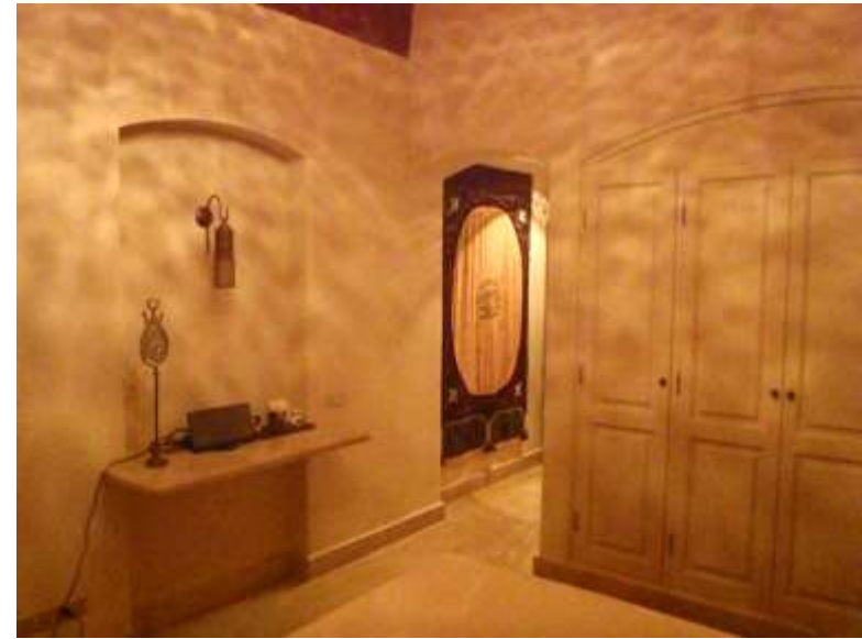
Master bed room and en suite bath room with shower and toilet