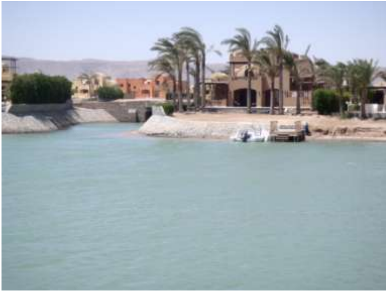
View onto the villa and over the lagoon