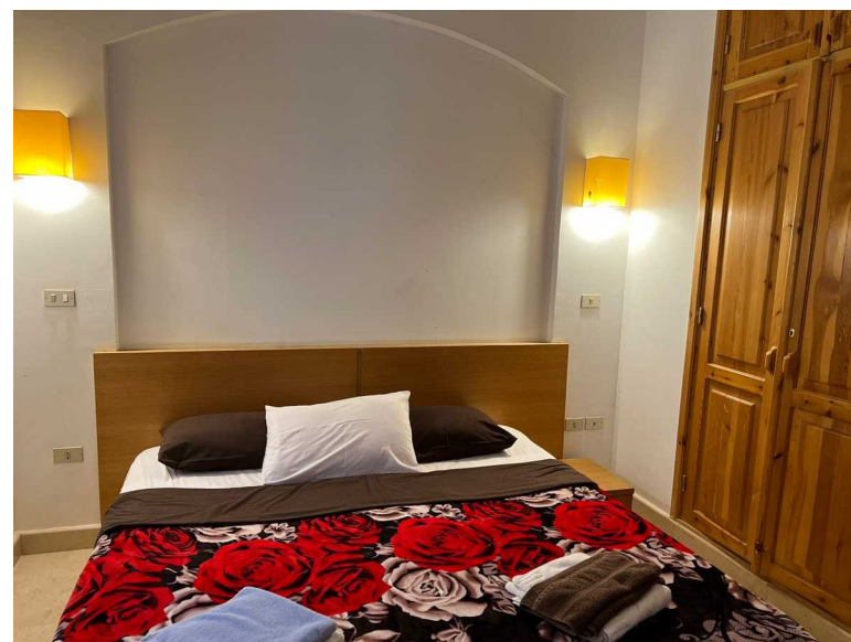
Bedroom with king-size bed, built-in cupboards and dresser with mirror